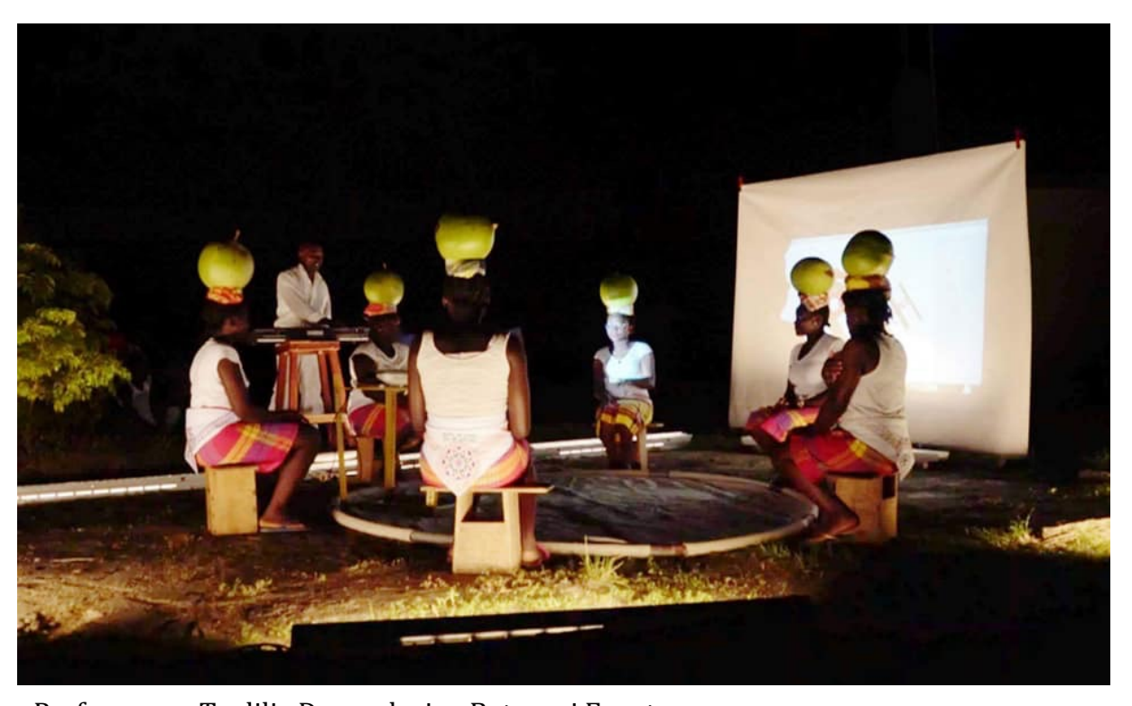
Performance Toelilie Dance during Botopasi Event