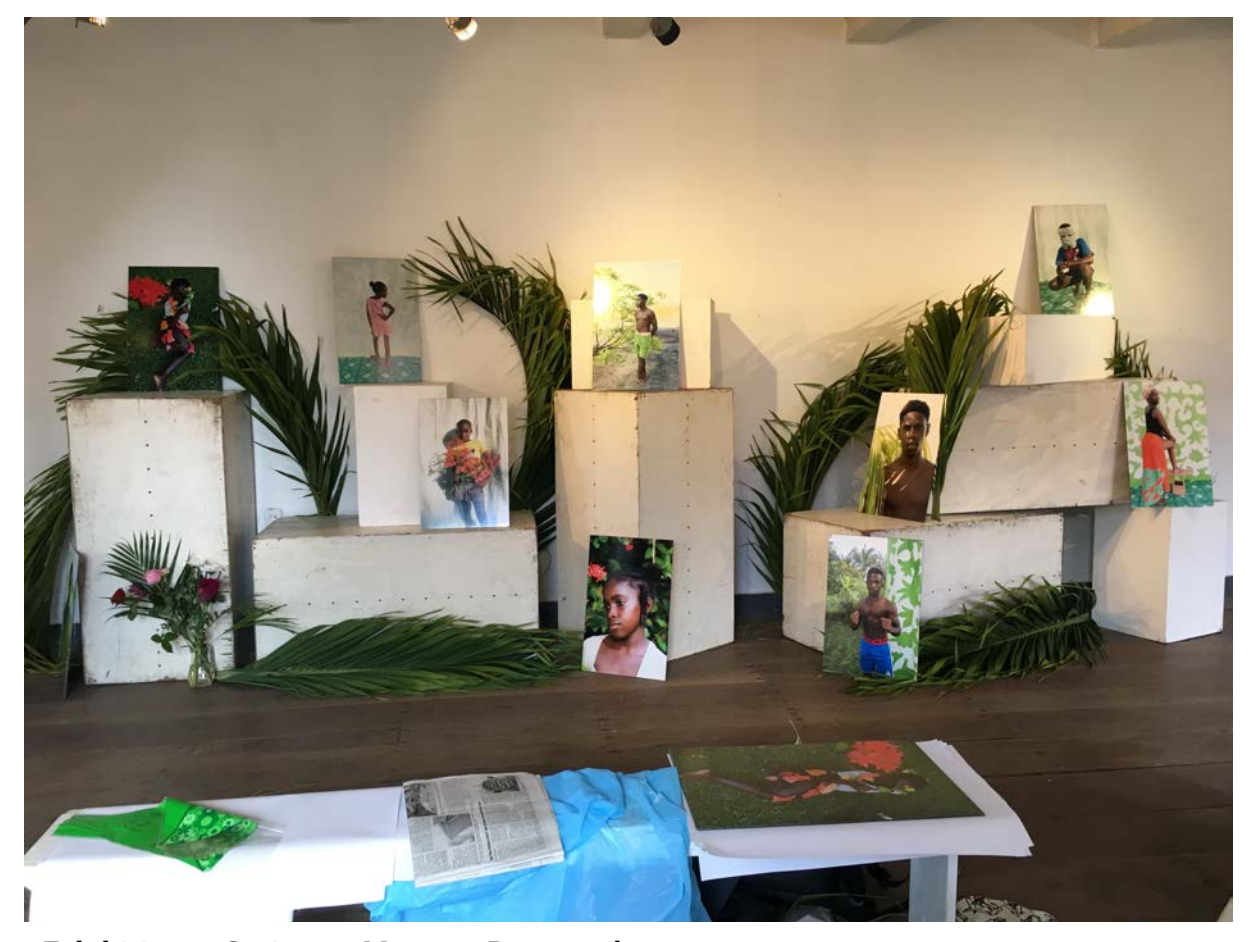
Exhibition at Suriname Museum Paramaribo