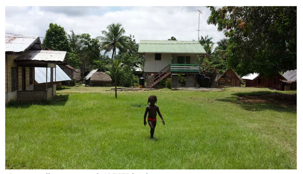
Botopasi village centre with ARTCEB head quarters