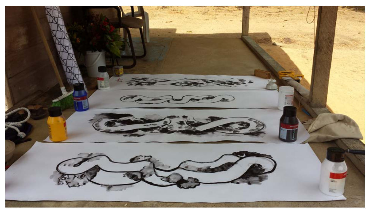
Workspace at the porche