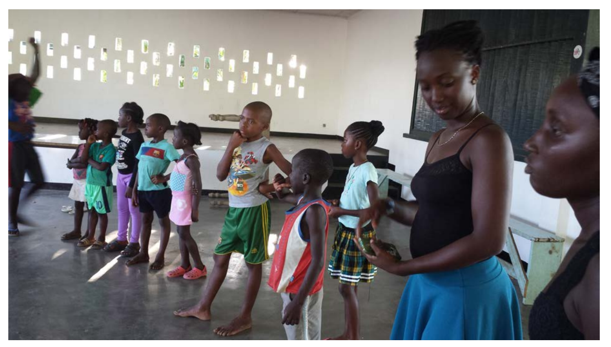
Workshop at the Botopasi community hall (also available as workspace)