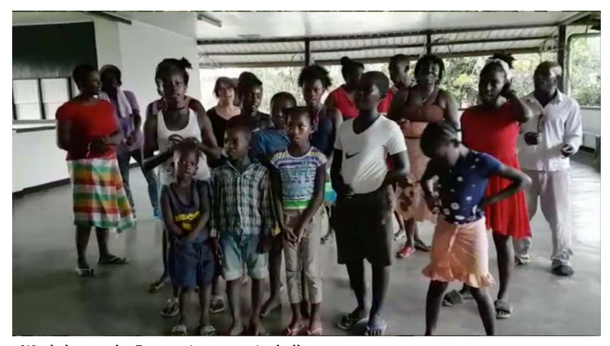
Workshop at the Botopasi community hall