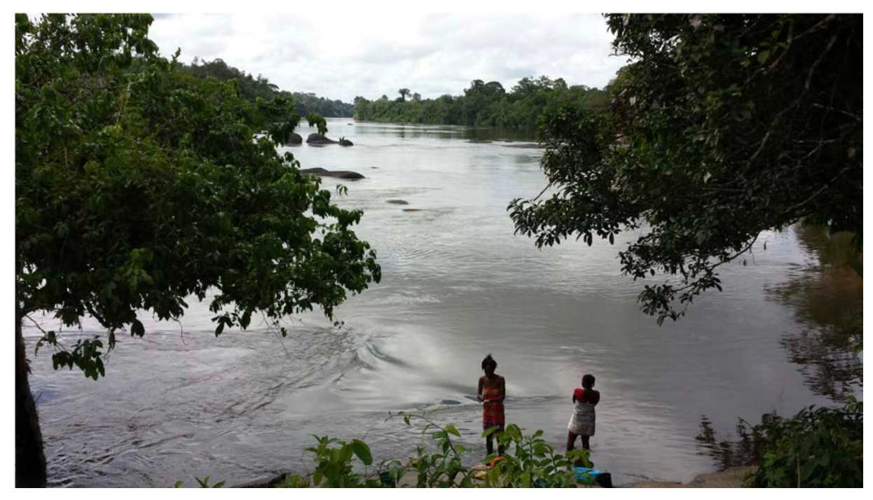
From the northside of Botopasi you can see the wonderfull trees of the Artceb park