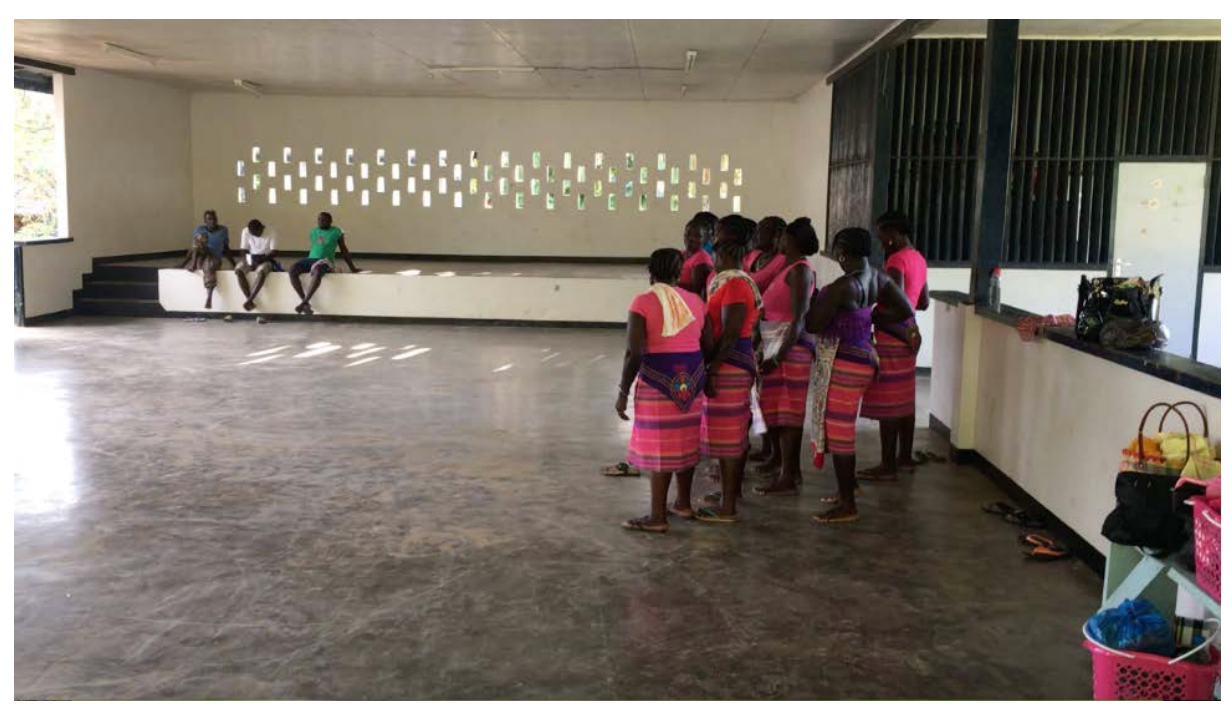
Dance workshop at the Botopasi community hall (also available as workspace)