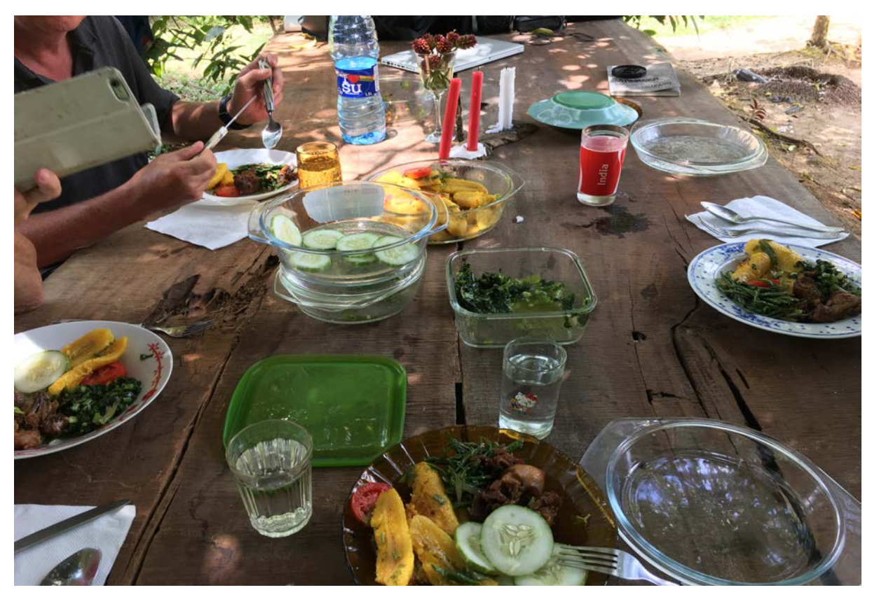
Conversation during lunch