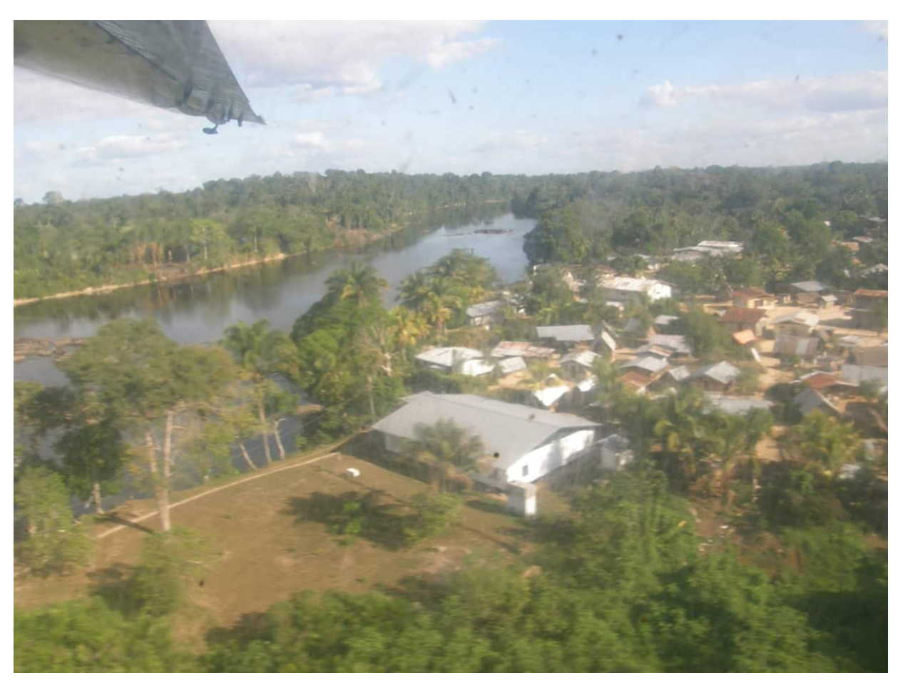
Botopasi village at the Suriname river General information about accommodations