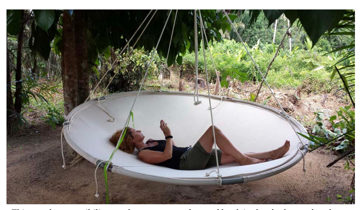
This may be a possibility to take a nap or read a good book in the shade on a hot day