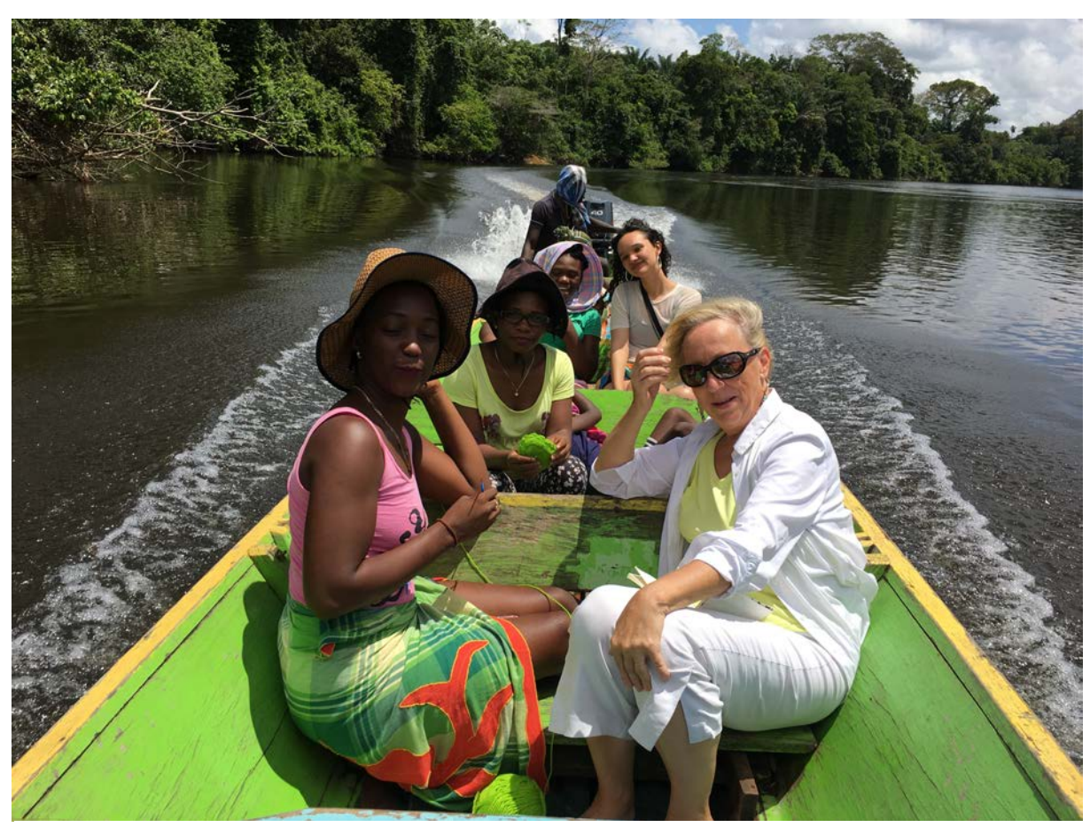
Enjoy the beautifull scenery during the trip to Botopasi