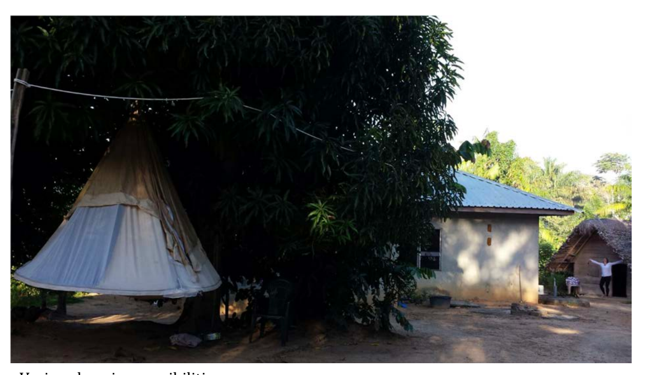
Various housing possibilities