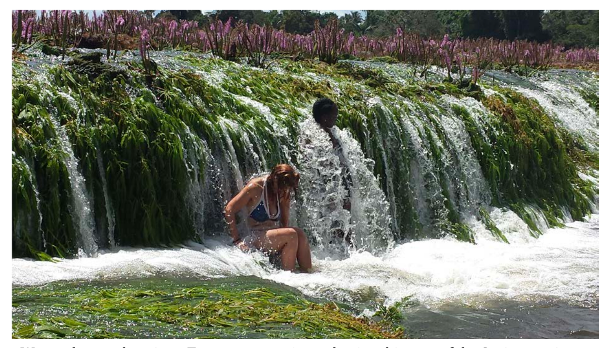
We can have a daytrip to Tapawata to swim and enjoy this part of the Suriname river